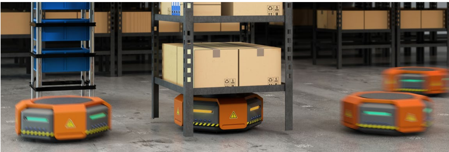
A fully automated warehouse could theoretically increase productivity while reducing the amount of floor space needed for operations.

With approximately 70% of goods delivered via long-haul commercial trucks (a gap that is expected to widen in the future), the introduction of autonomous long-haul