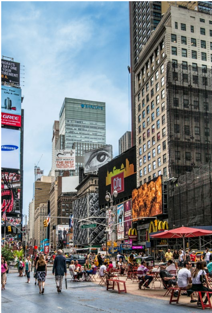
Times Square's recently completed 270,000-square-foot pedestrian recapture project.

If one subscribes to the vision of some futurists, fewer vehicles on the road as well as the introduction of artificial intelligence will greatly reduce traffic congestion and