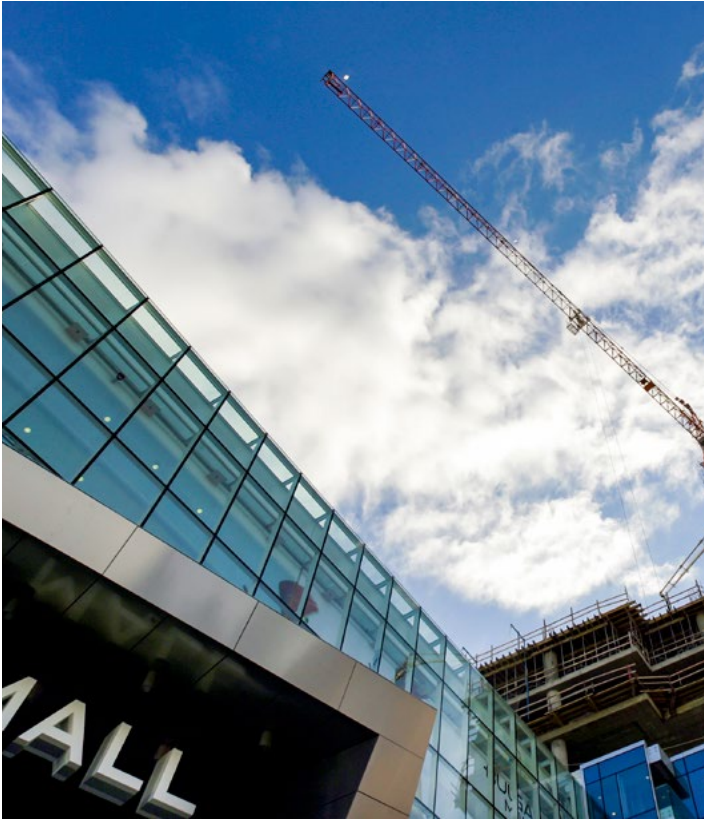
Malls that have larger acreage currently allocated to parking may be more desirable to an investor looking for a redevelopment opportunity.

Shopping center owners and developers should also keep an eye on the AV trend. A typical suburban mall sits in the center of an expansive parking lot, usually several times the footprint of the mall itself, as it is the least expensive way to accommodate the parking requirements for mall