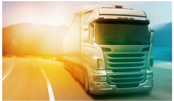
The introduction of autonomous long-haul trucks would be a welcomed addition to an industry that is struggling from a shortage of drivers.

are increasingly demanding, expect more supply chain disruption among e-commerce players of all sizes and across all distribution channels, including rail. Location and size of fulfillment centers and distribution buildings may need to be reconsidered as developers increasingly design these buildings with more flexibility, decreased surface parking for warehouse workers, and the ability to take advantage of higher floor-to-area ratios. When it comes to shipping and receiving goods overseas, faster fulfillment cycles may allow industrial facilities to relocate farther away from seaports and container terminals. AVs would be able to cover more distance in less time, allowing a single distribution center to cover a wider geographical proximity.