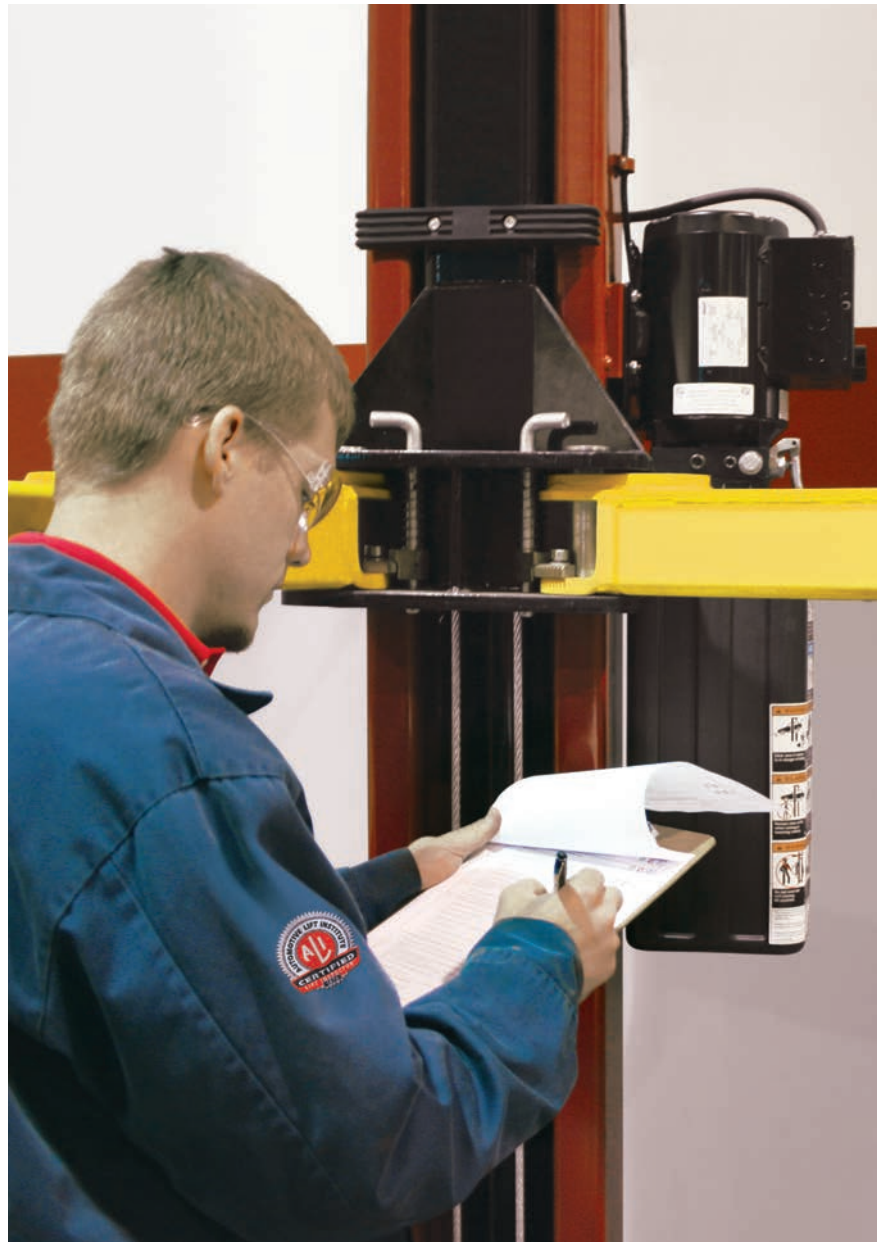
ALI Certified Lift Inspectors are qualified to inspect any brand or model of vehicle lift.

In addition to annual lift inspections conducted by qualified lift inspectors, most lift manufacturers recommend that lift operators themselves inspect