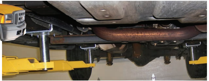
Frame-cradling adapters are recommended for two-post lifts.