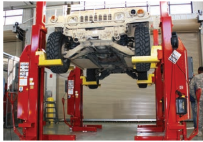
Mobile column lifts offer flexibility.

ing a two-post lift, we require the use of frame-engaging adapters when lifting a vehicle with a frame construction," he says. "Frame-cradling adapters reduce the risk of the vehicle's frame sliding off the lift's pads."