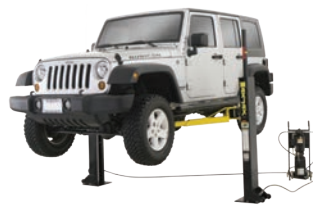
The Patented MaxJax