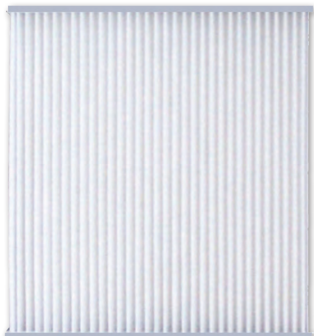
New Cabin Air Filter takes less than 15 minutes to install and has a 12,000 to 15,000-mile recommended change interval.